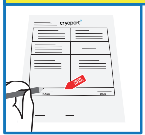
1. Sign and date.