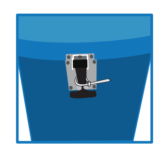
Zip-tie is now securely around the black handle.

For those shipments containing regulated dangerous goods/hazardous materials, the shipper is responsible for correctly preparing the shipment according to the current International Air Transport Association (IATA) and International Civil Aviation Organization (ICAO) dangerous goods regulations.