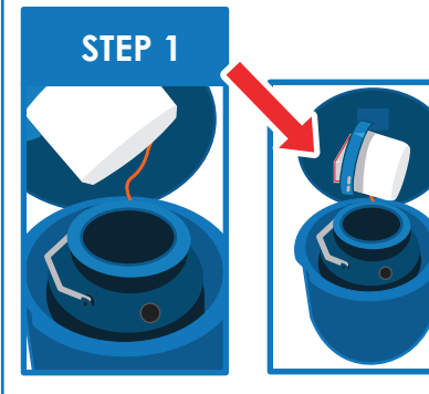
Once the specimen is packaged, remove the lid and rest it sideways behind the dewar and against the blue enclosure lid.