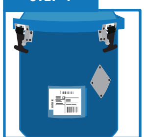
Once the shipper has arrived, remove old shipping pouch and zip-ties.