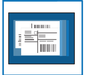
Close the shipping pouch and remove sticker backing.