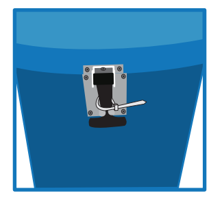
Zip-tie is now securely around the black handle.

For those shipments containing regulated dangerous goods/hazardous materials, the shipper is responsible for correctly preparing the shipment according to the current International Air Transport Association (IATA) and International Civil Aviation Organization (ICAO) dangerous goods regulations.