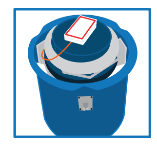
Open lid to expose the dewar.