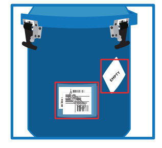
Place the shipping pouch and the EMPTY label on the metal plates.