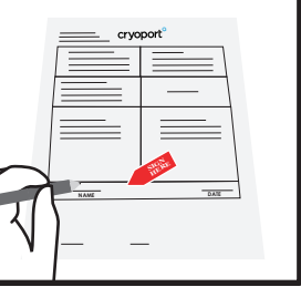
1. Sign and date.