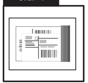
Close the shipping pouch and remove sticker backing.