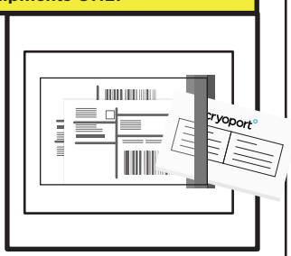
2. Return all documents being shipped behind the Air Waybill Including any: Permits, Forms, Licenses, etc.

IF THE DRY SHIPPER DOES NOT EMIT VAPOR WHEN PLUG IS REMOVED PLEASE CONTACT CUSTOMER SERVICE IMMEDIATELY, BY CALLING (949) 470-2305 OR EMAIL CS@CRYOPORT.COM