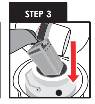
Place any returnable accessories back into the dry shipper.