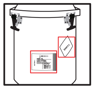
Place the shipping pouch and the EMPTY label on the metal plates.