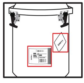
Place the shipping pouch and the EMPTY label on the metal plates.