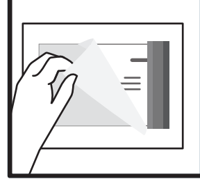
Place shipping pouch on metal plate.