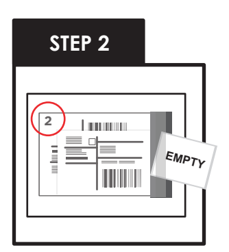
Remove documents from the shipping pouch #2.