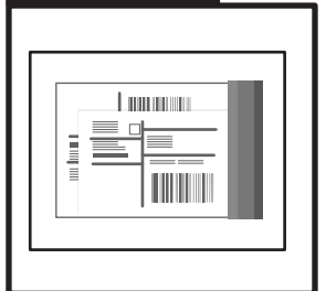
Close the shipping pouch and remove sticker backing.