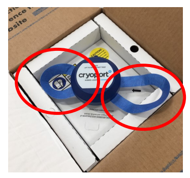
Assure blue straps are left on outside of the shipper plug!