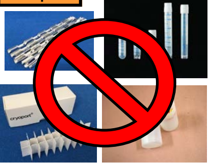
WARNING! Do not leave any samples or commodities in the shipper!