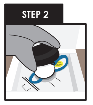
Wearing safety goggles and cryogenic gloves, pull gently upward to remove the shipper vapor plug.