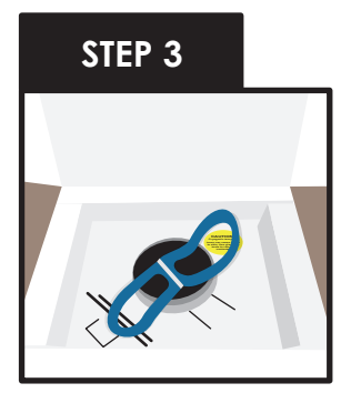
Cryoport recommends the commodity is loaded in a Safepak<sup>®</sup> as the bag is capable to withstand LN2. DO NOT REMOVE THE COMMODITY AT ANY TIME.