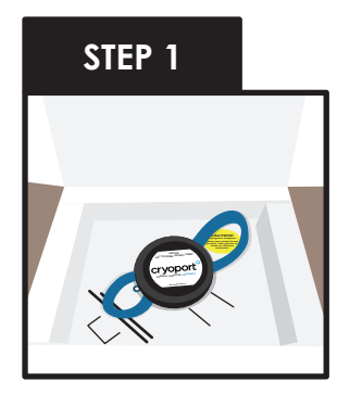
After opening the loaded shipment, ensure the blue Safepak<sup>®</sup> straps stay outside the opening of the dewar at all times.