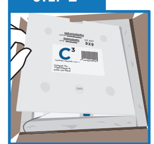
Remove the Phase Change Panel (PCP)