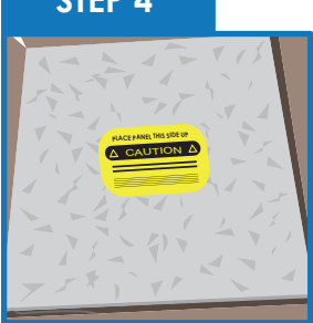
Replace the (PCP) and the Cooler Lid.