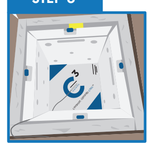
You now have access to the specimen chamber to remove your payload.