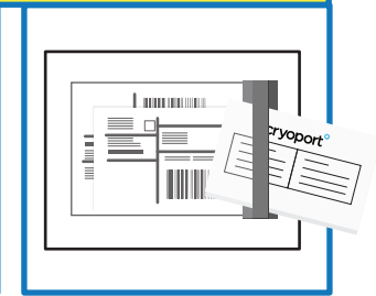
Return all documents being shipped behind the Air Waybill Including any: Permits, Forms, Licenses, etc.