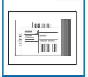
Close the shipping pouch and remove sticker backing.