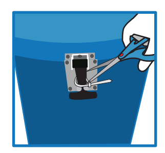
Remove zip-ties from both black handles with scissors.