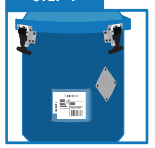
Once the shipper has arrived, remove old shipping pouch and zip-ties.