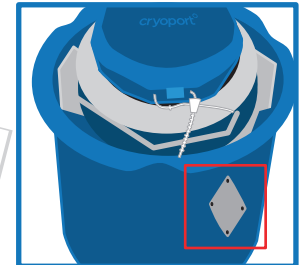
Remove any classification labels from the shipping pouch and place on the metal diamond.