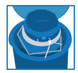
Open lid to expose the dewar.