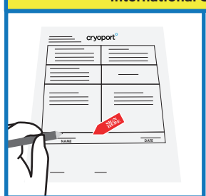
Sign and date.