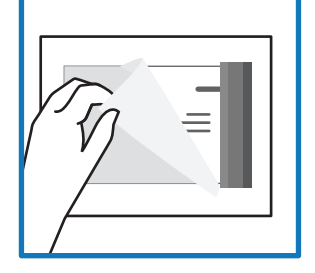
Place shipping pouch on the enclosure's metal plate.