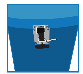
Zip-tie is now securely around the black handle.

For those shipments containing regulated dangerous goods/hazardous materials, the shipper is responsible for correctly preparing the shipment according to the current International Air Transport Association (IATA) and International Civil Aviation Organization (ICAO) dangerous goods regulations.