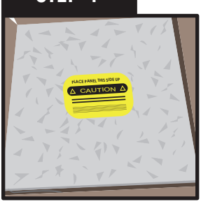
Replace the (PCP) and the Cooler Lid.