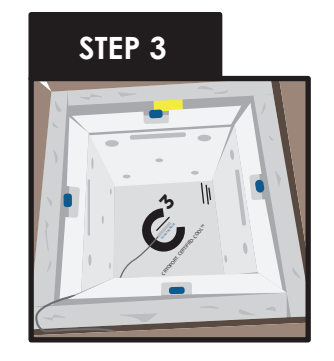
You now have access to the specimen chamber to insert your payload.