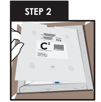
Remove the Phase Change Panel (PCP)

Open box using PPE for cold temperatures and remove the cooler lid. When opening box, be sure not to puncture the shipper. Puncturing the shipper will affect the hold time.