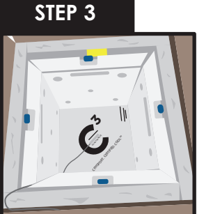
You now have access to the specimen chamber to remove your payload.