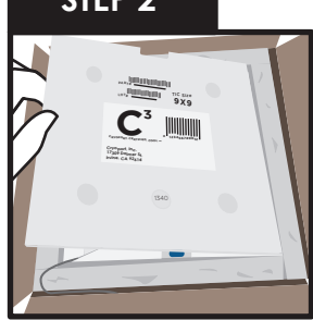
Remove the Phase Change Panel (PCP)