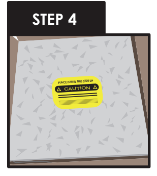
Replace the (PCP) and the Cooler Lid.